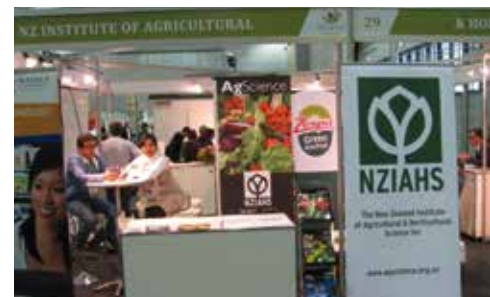
The NZIAHS exhibition booth at the Congress was part of "Kiwi Corner", with Plant & Food Research, Zespri and Massey University.