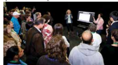
Science posters presented using large video monitors, a change of format that seemed to work well.