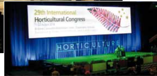
The main stage in the Great Hall for the 29th International Horticultural Congress, Brisbane 2014.

THE INTERNATIONAL HORTICULTURAL CONGRESS 2014 is the major event of the International Society for Horticultural Science, and has been held every four years since 1864 (with a few breaks for major world events). The 2014 conference was held in Brisbane last August, only the second time it has been held in the southern hemisphere. NZIAHS was proud to be one of the host societies along with the Australian Society for Horticultural Science and the Secretariat for the South Pacific.